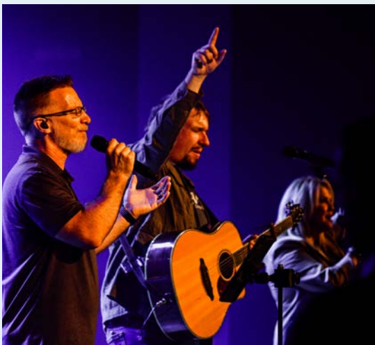
Ridgepoint Church, Wichita, KS

OUR COMMUNITY OF DONORS GIFTED A VARIETY OF ASSETS THROUGH MB FOUNDATION IN 2023 TO BENEFIT THE MINISTRIES THEY LOVE. DISBURSEMENTS WERE MADE TO EDUCATIONAL INSTITUTIONS, MISSIONS AROUND THE GLOBE, AND THE LOCAL CHURCH, EACH HAVING TRANSFORMATIONAL IMPACT FOR CHRIST'S KINGDOM.