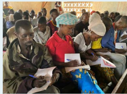
Central MB Church, Tembo, DR Congo