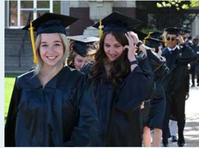
Tabor College, Hillsboro, KS